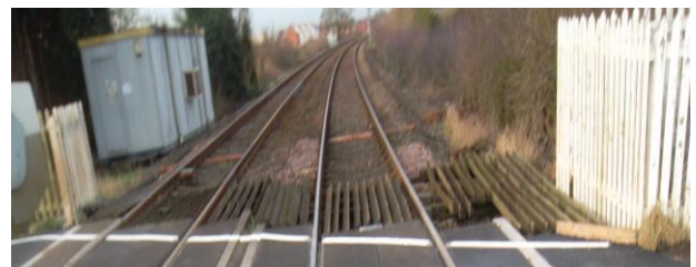
New Fibreglass Trespass Guards